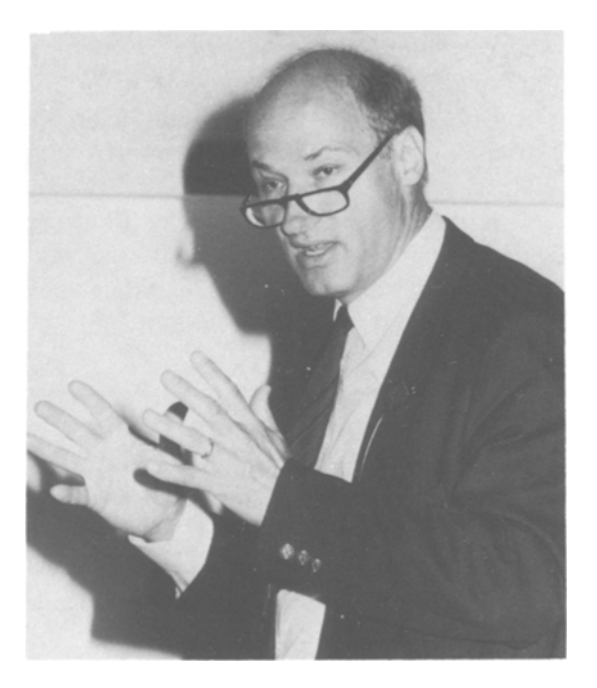
The important role of thermoanalytical methods in the field of pharmaceutical and galenic research is outlined. The thermodynamic stability of polymorphic forms of a substance is discussed.

CENTRAL RESEARCH DEPARTMENT, CIBA-GEIGY LTD, CH-4002 BASEL, SWITZERLAND